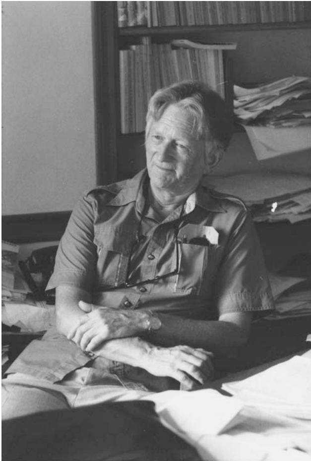
Figure 2. Atle Selberg, 1981.

Both were prodigies. Erdős (so the stories go), at age five, realizing that 250 less than 100 is 150 below zero. Selberg, at age seven, showing that the difference between consecutive squares is an odd number. They were both winners of the prestigious Wolf Prize. But in (at least) two ways, however, their mathematical styles were antipodal.