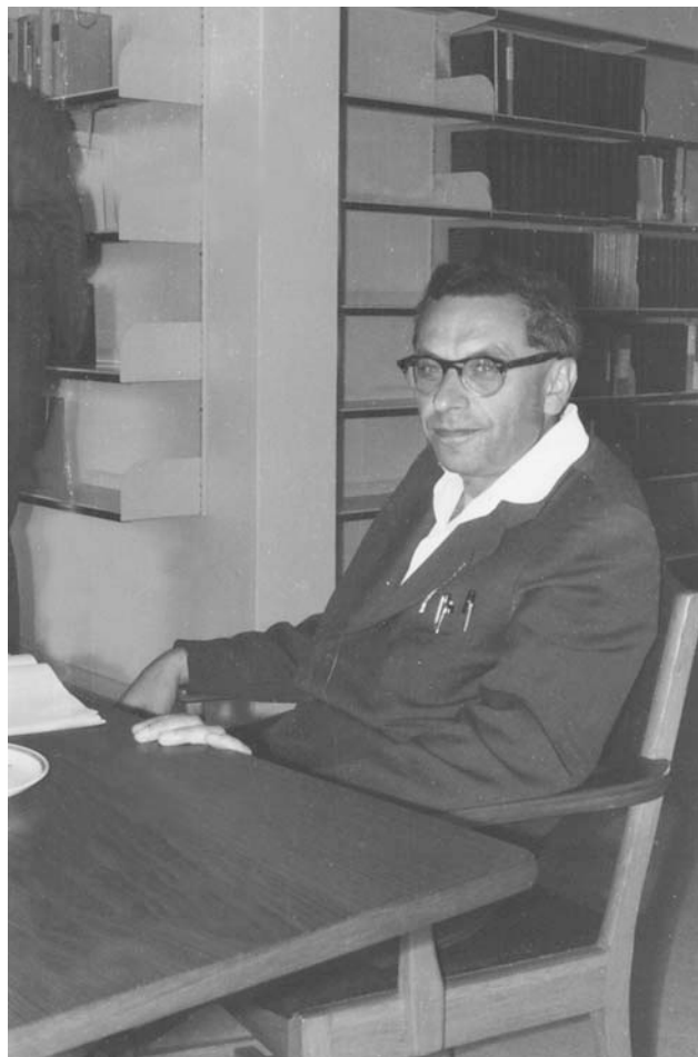
Figure 1. Paul Erdős. 1962.

Paul Erdős and Atle Selberg were both giants of twentieth century mathematics. They (Erdős 1913–1996, Selberg 1917–2007) were of the same mathematical generation.