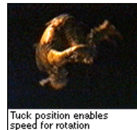
Tuck position enables speed for rotation

What's tougher to do is a full body somersault. It's called the conservation of angular momentum. That's the long way of saying that the smaller and more compact the acrobats can make their bodies, the faster and easier they move through space.