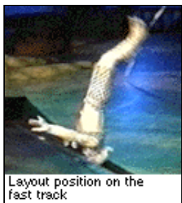
Layout position on the fast track

"If you're in a layout position (or straight body), you have more inertia, and it takes more energy to get around," Graham says. "Whereas if you're twisting, that is rotating around the long axis in your body, then you want to be very straight because it's very hard to twist if you're in a ball."